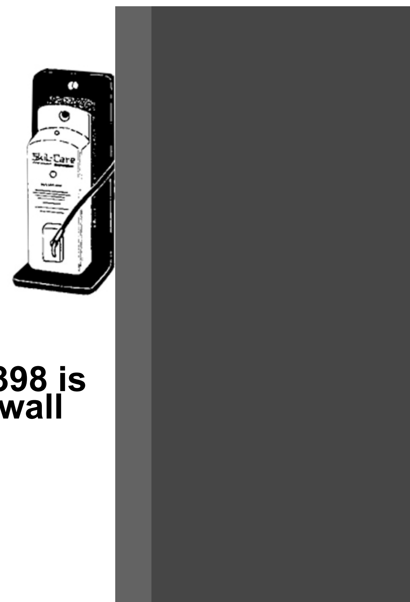
Model number 909398 is only used for the wall